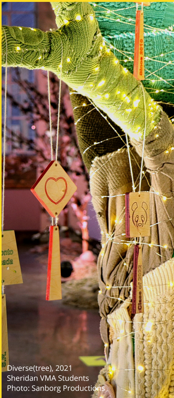
Diverse(tree), 2021 Sheridan VMA Students