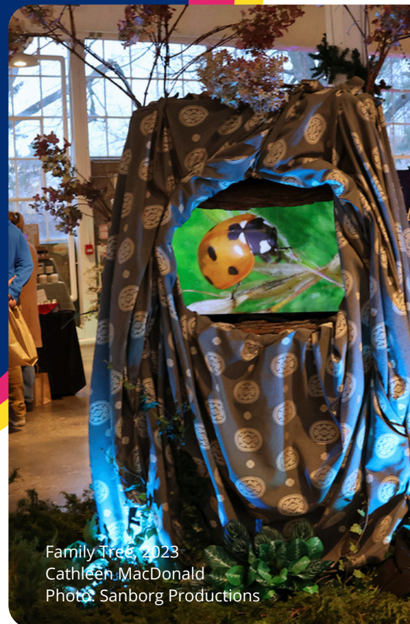
Family Tree, 2023 Cathleen MacDonald