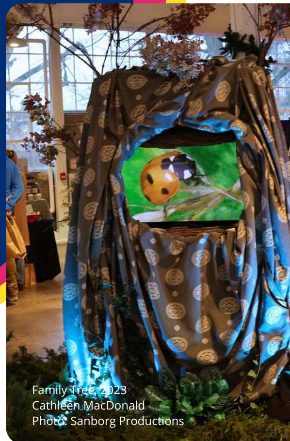
Family Tree, 2023 Cathleen MacDonald