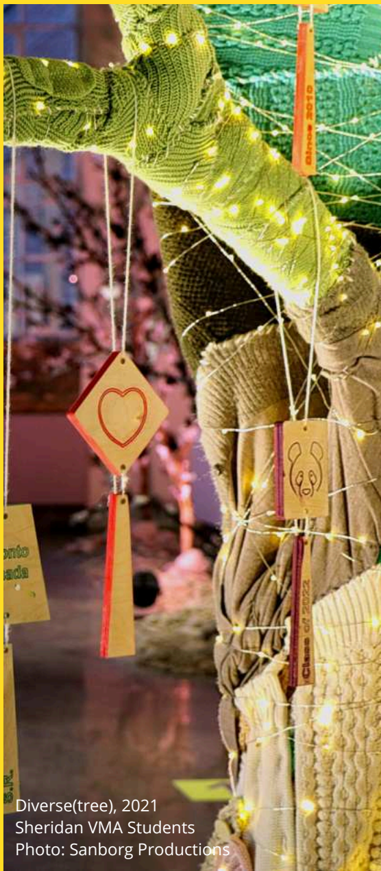
Diverse(tree), 2021 Sheridan VMA Students