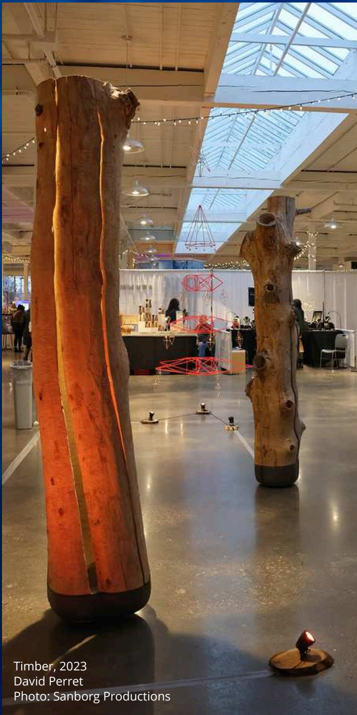
Timber, 2023 David Perret

Installations should meet the following structural guidelines: